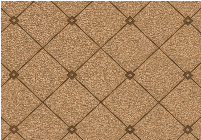
Leather: Pearlessence Smoke

Lattice is an elegant addition to any leather with its interlaced grid pattern and diamond-shaped spaces.