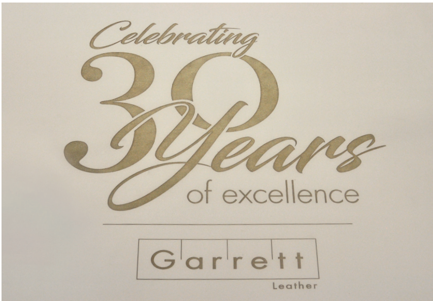
Leather: Flight Chickadee