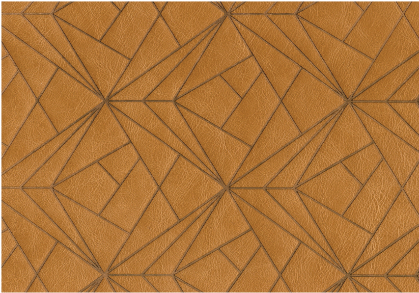
Leather: Resilience Tiger Eye

Prism is a beautiful pattern with geometric shapes.